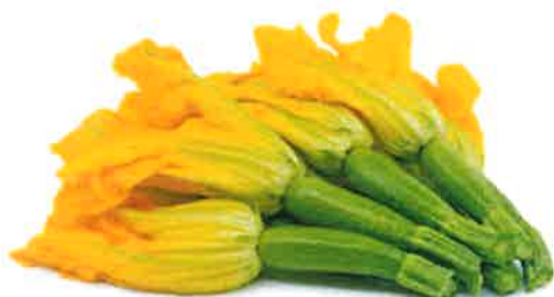
ONTARIO ZUCCHINI FLOWERS